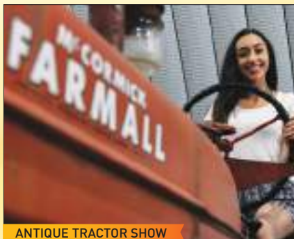
ANTIQUE TRACTOR SHOW

Come meet our furry friends - ponies, donkeys, cows, sheep and Manitoba's most cuddly goats. Sheldon, the fun-loving donkey and the our ever-cuddly Highland bull Leroy is waiting to meet you.