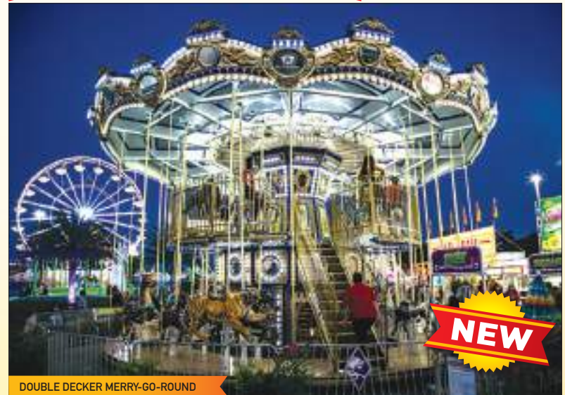
DOUBLE DECKER MERRY-GO-ROUND