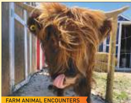
FARM ANIMAL ENCOUNTERS