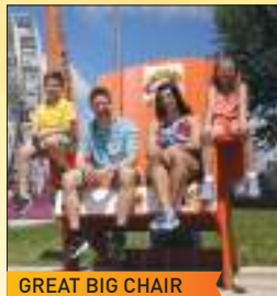
GREAT BIG CHAIR