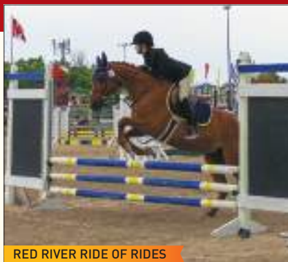
RED RIVER RIDE OF RIDES